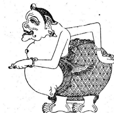
Kjahi Turah Semar

As nature's turmoil subsides, a bright shaft of light pierces the sky in the east, and just as swiftly as it appeared it vanishes. In its place we see one of God's funnier creatures. Plump as a pumpkin quietly he sits like a mound of earth. He is called Clown Semar. . . . One can hardly call him a man for his breasts are long, but one can't call him a woman for he is, in fact, a man. Though extremely ugly, he is in reality the ancient god Ismaja, protector of Java, descended to earth. He acts as servant to the Prince Ardjuna. But in truth he could rule the world if he so desired, and the highest Gods could not prevent it. 16